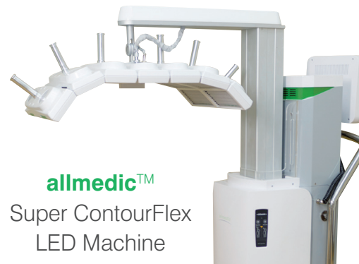
allmedic™ Super ContourFlex LED Machine